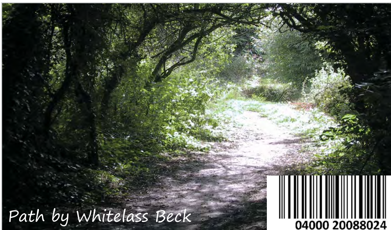
Path by Whitelass Beck

Cross over the bridge and in a few metres turn sharp left to go through a gate into the playing field. Turn right and head for a kissing gate at the far right edge of the field. After this gate, go diagonally left towards another kissing gate about 200 metres away close to the Cod Beck again.